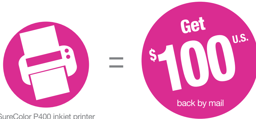
SureColor P400 inkjet printer

Purchase a SureColor ® P400 or P600 inkjet printer and receive the following back by mail: