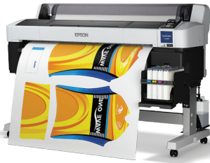
Buy an Epson SureColor F6200, F7200 or F9200 printer